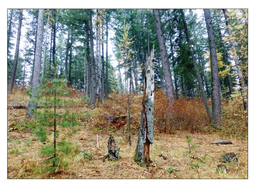
This soft snag provides great habitat for small cavity nesting birds. Note the shrub patch in the back.

Pruning some trees helps reduce the ability of a fire to climb up from the ground to the canopy of your trees.