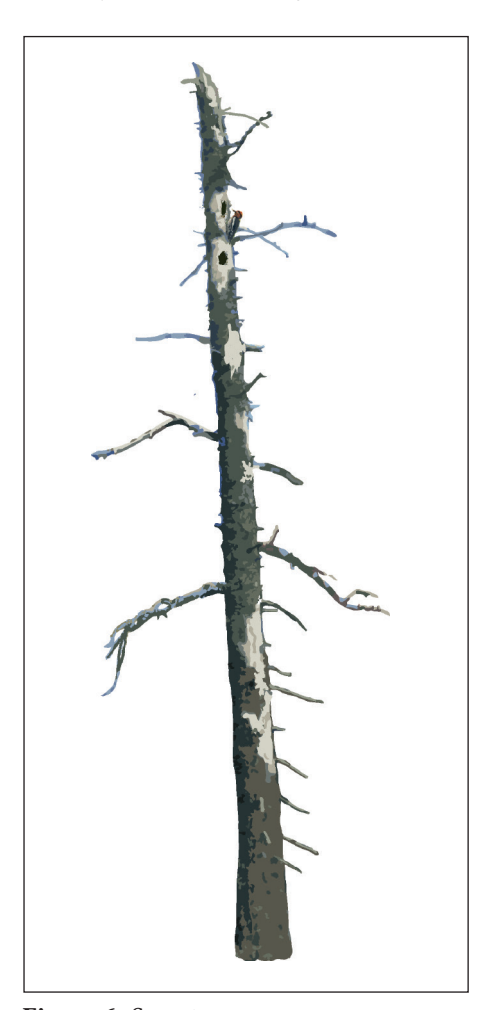
Figure 6. Snag tree.

Tip: Take advantage of harvesting equipment to make some snags. Mechanical harvesters can top trees, leaving 8-20 foot stumps, especially important if you are currently lacking in snags. Climbers can top some trees (creating jagged tops) or girdle 2/3 of the way up to make snags.