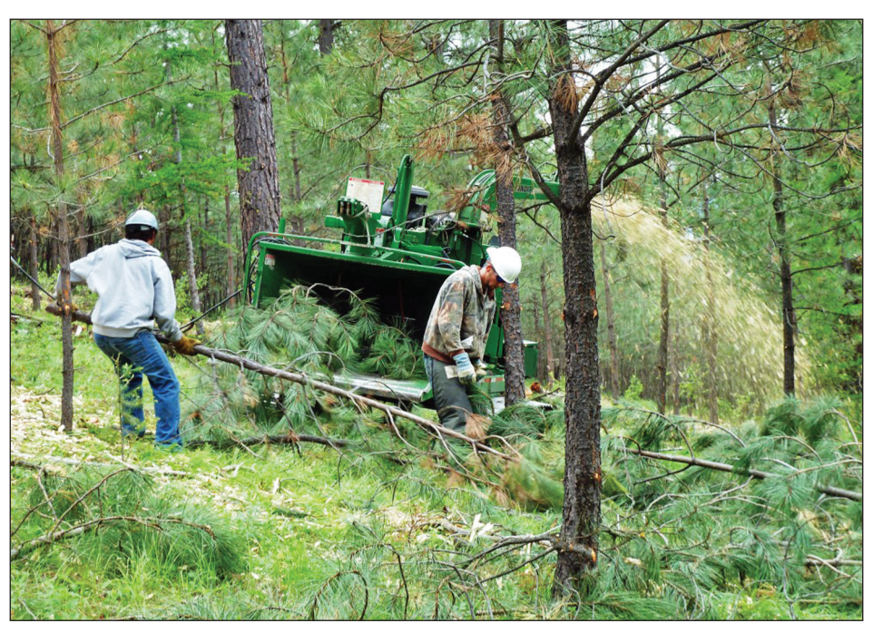
Making sure you properly dispose of slash from fuels reduction treatments is critical to reduce the chance of a beetle outbreak.

A publication by the Woodland Fish and Wildlife Group, 2016. Publications by the Woodland Fish and Wildlife Group are intended for use by small woodland owners across the Pacific Northwest. Some resources here are state specific, but should be generally useful to landowners throughout the Pacific Northwest.