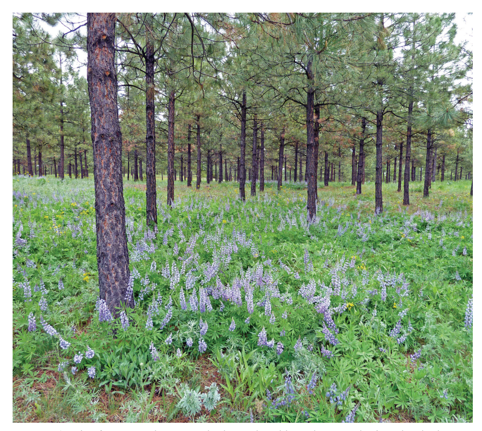
Figure 3b. This forest stand was evenly thinned and heavily mowed. Though it looks very tidy, it is now a very simple forest stand with limited wildlife habitat value.

news is that we don't have to choose one or the other. We don't have to sacrifice all wildlife habitat for the sake of fuels reduction, or vice versa.