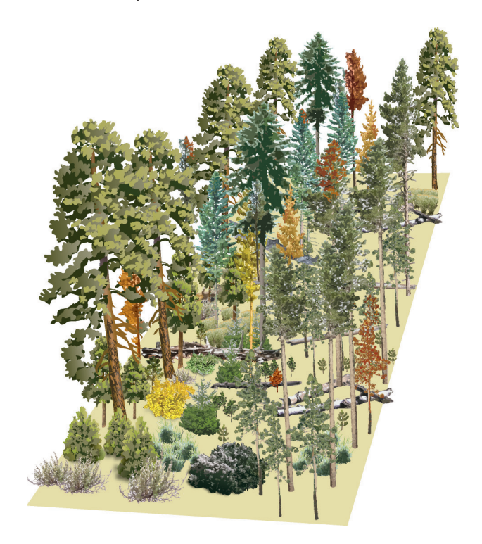
Figures 1 and 2. The figure on the left shows a historic forest that experienced regular low intensity fire. An individual tree here or there may have torched, but for the most part the fire stayed low. The figure on the right shows the same forest after decades of fire suppression. There is increased competition and reduced tree vigor, as well as increased risk for a high intensity fire. There is also reduced wildlife habitat value for some species in terms of forage and large healthy trees.