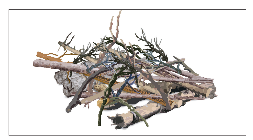
Figure 7. Habitat Piles.

Dense pockets of young conifers and shrubs provide quality habitat for many species, such as feeding or nesting habitat for songbirds. They also provide browse and cover for big game species. Patch retention in thinning units can provide this habitat, but requires forethought and follow through. Mark areas to be maintained in a denser state from 30-50 feet across, and at least the same in length, (preferably longer) to provide the "patchy and clumpy" mosaic pattern. These areas should be left un-thinned, (or thinned lightly), to maintain mid-level vegetation (shrubs and young trees) and provide sight distance cover for large mammals such as deer, elk and bear. Patches should be configured across the landscape to break long sight distances. Try to stagger patches at distances of 200-300 feet apart. Try to avoid more than 500' between clumps or patches. Retaining several patches or clumps will help deer and elk tremendously. Visual cover patches along roads and small ridge crests are extremely important.