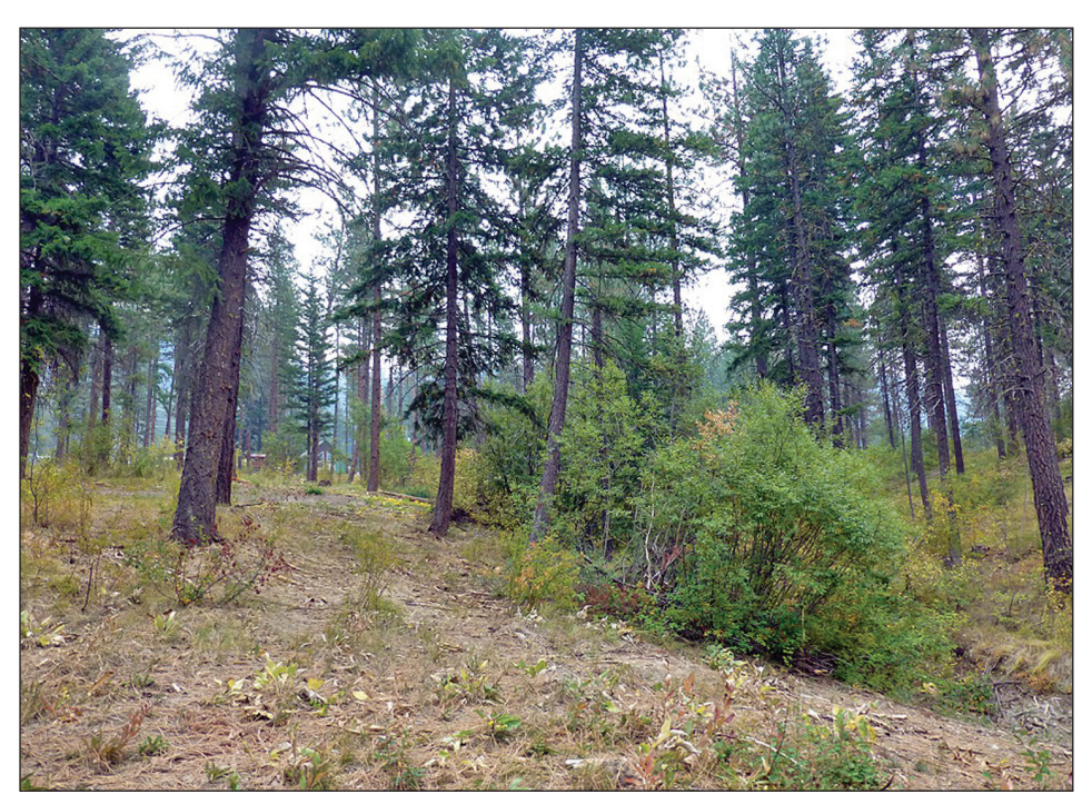
Small clumps left in this stand do not pose a hazard to remaining trees and provide important hiding cover.

Ultimately, you need to evaluate your personal risk, evaluate the trade-offs of different practices, and create a management plan for your property that meets your goals, your resources, and the scale of your property. We feel confident that the recommendations here will help anyone implementing a fuels reduction project on their property. We can provide improved wildlife habitat, forest health, and aesthetics, qualities.