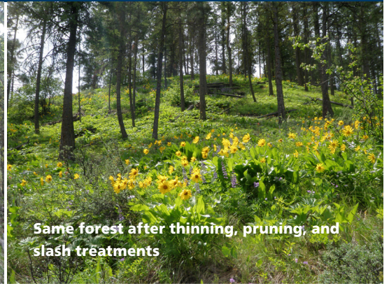
Same forest after thinning, pruning, and slash treatments

ADDRESSING OUR STATE'S FOREST HEALTH CRISIS, AND IN TURN MAKING OUR COMMUNITIES MORE WILDFIRE RESILIENT, WILL TAKE AN ALL-LANDS, ALL-HANDS APPROACH TO FOREST MANAGEMENT."