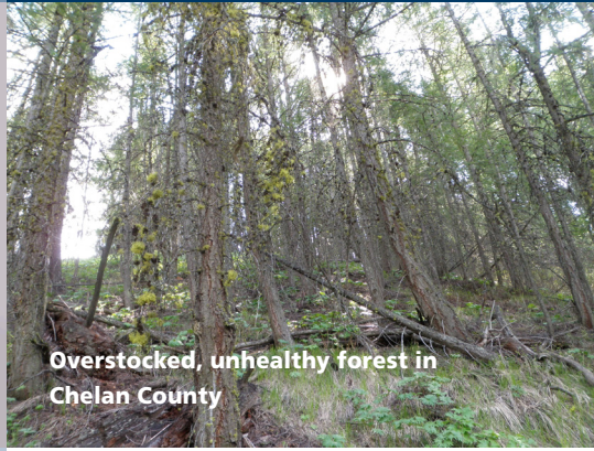
Overstocked, unhealthy forest in Chelan County