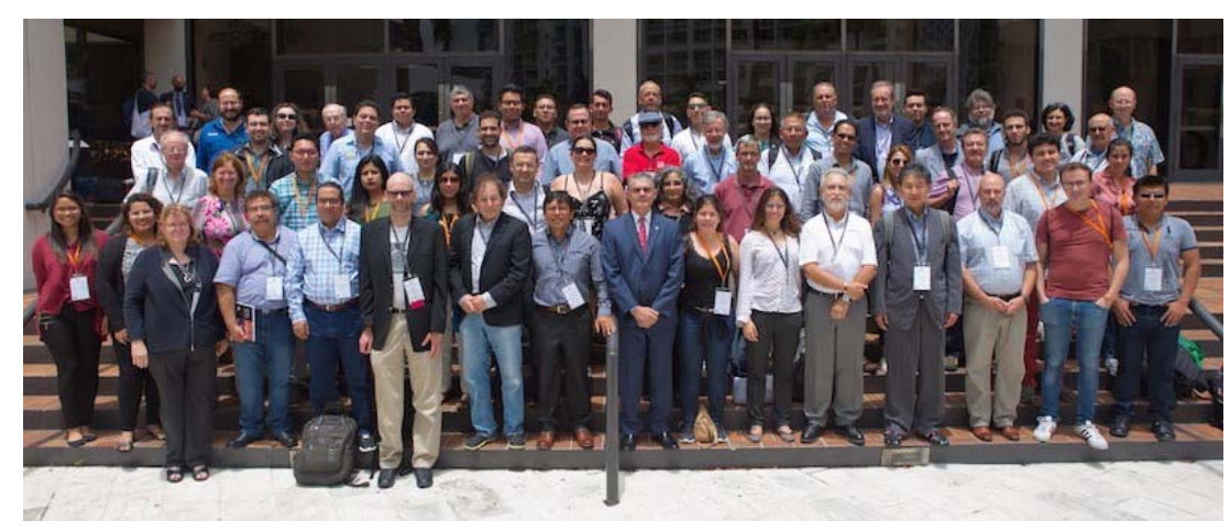
LACSC and SSA members at the conference

International Association of Seismology and Physics of the Earth Interior (IASPEI). The meeting was an opportunity to build collaborations and work towards mitigation of earthquake hazards and increase resilience to natural disasters, including tsunamis.