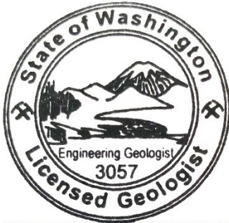
Joshua A Hardesty

WALERT aims to quickly identify and assess geologic hazards associated with wildfires to inform decision making and help focus the efforts of local officials and residents who may be impacted by post-wildfire hazards. All observations and interpretations are based on empirical evidence and local knowledge. Not all areas or hazards were evaluated. We encourage landowners, land managers, and those potentially at risk from post-wildfire hazards to consult qualified professionals for site-specific analysis of geological hazards and flood risk and prepare accordingly.