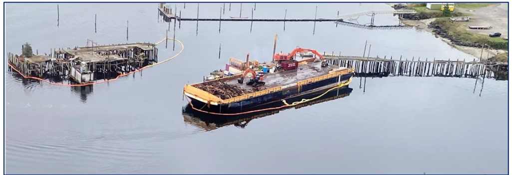
Deconstruction of the Former High Tides Seafood Pier in Neah Bay, WA

In 2023, the Legislature established the Derelict Structure Removal Program (DSRP) to remove or refurbish derelict structures in the aquatic environment (RCW 79.160). The Department of Natural Resources (DNR) received funding to build a program and remove four priority structures, plus a proviso to remove marine tire piles. In just two years, DNR will have successfully built a new program and fully removed two highly impactful derelict structures and two tire “reef” piles amounting to 2,670 tires, 1,810 piling and 26,150 sq/ft of overwater structure removed from the aquatic environment.