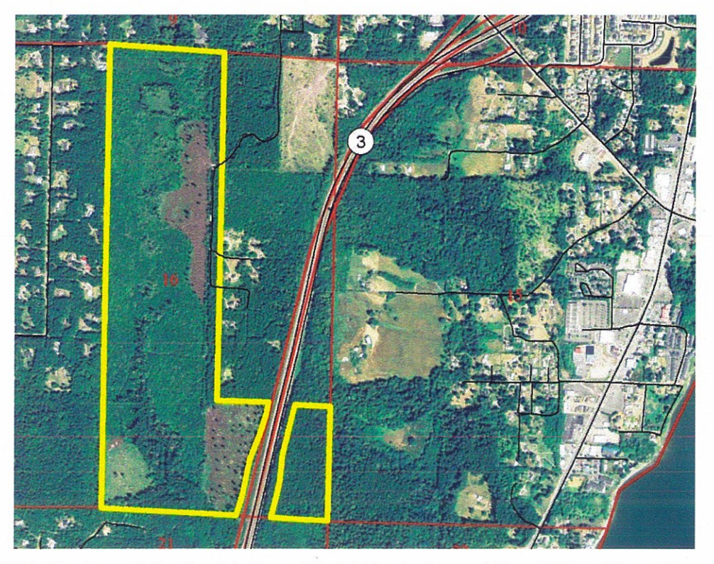
Within Portions of Section 16, Township 26 North, Range 1 East, W.M., Kitsap County