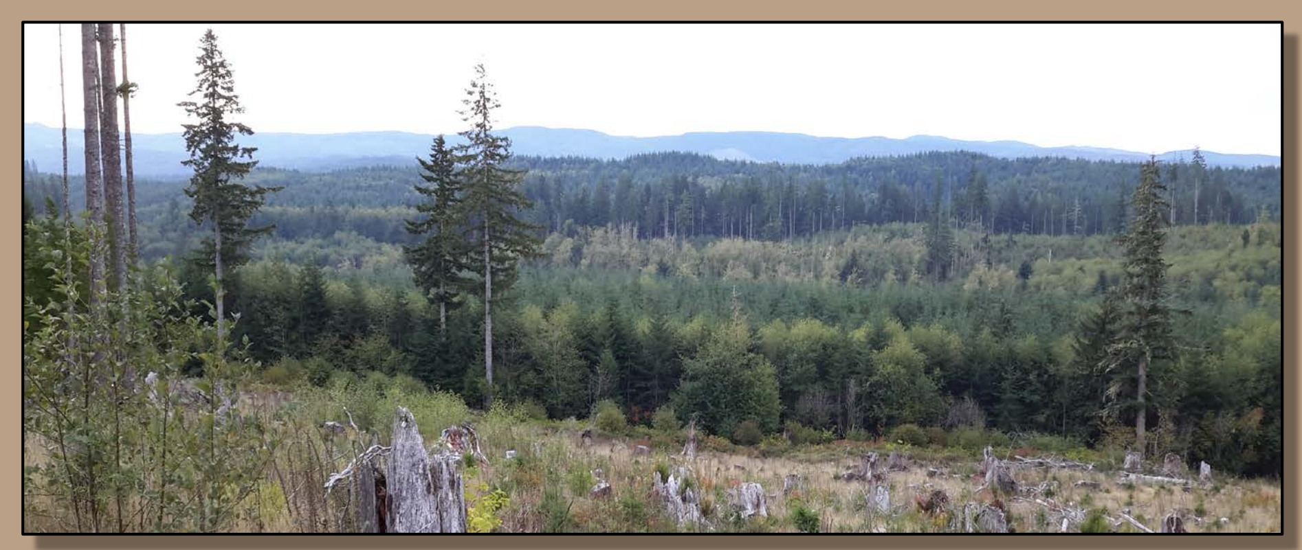
Douglas Fir marking the North line of the SW parcel