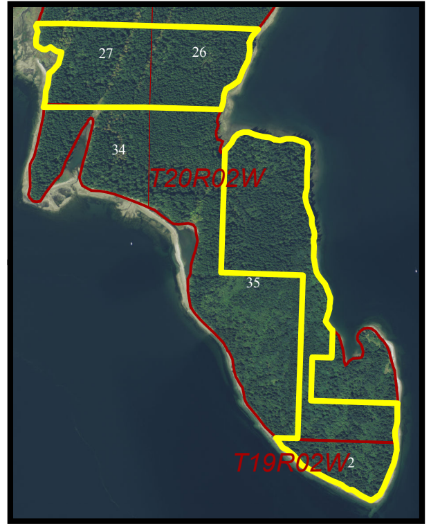
Within Section 2, Township 19 North, Range 2 West, W.M., and Within Sections 15, 26, 27, & 35, Township 20 North, Range 2 West, W.M., Mason County