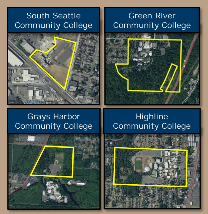
Charitable, Educational, Penal & Reformatory Institutions (CEP&RI) Trust land in King & Grays Harbor Counties – leased to community colleges