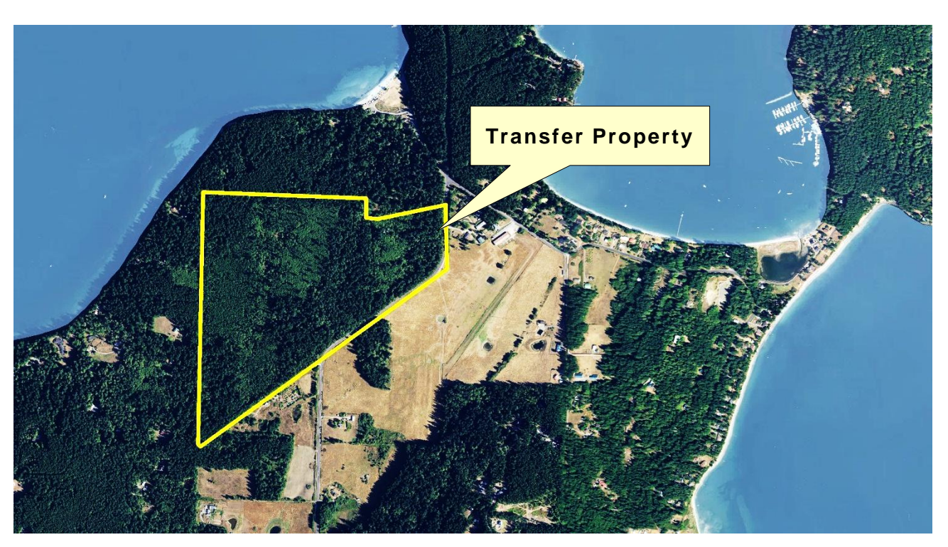
The transfer property is located within Portions of Government Lot 6 and SW1/4 of SE1/4 of Section 2 together with Government Lot 2 of Section 11, both sections in Township 35 North, Range 2 West, W.M., on Lopez Island in San Juan County.