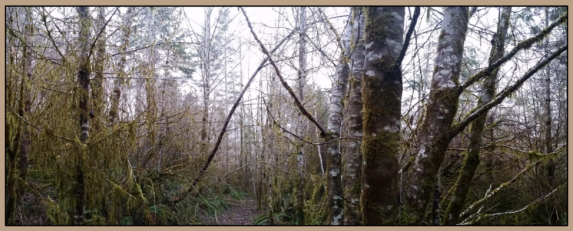
SW extent showing mixed hardwoods and Conifer, with DF in background.