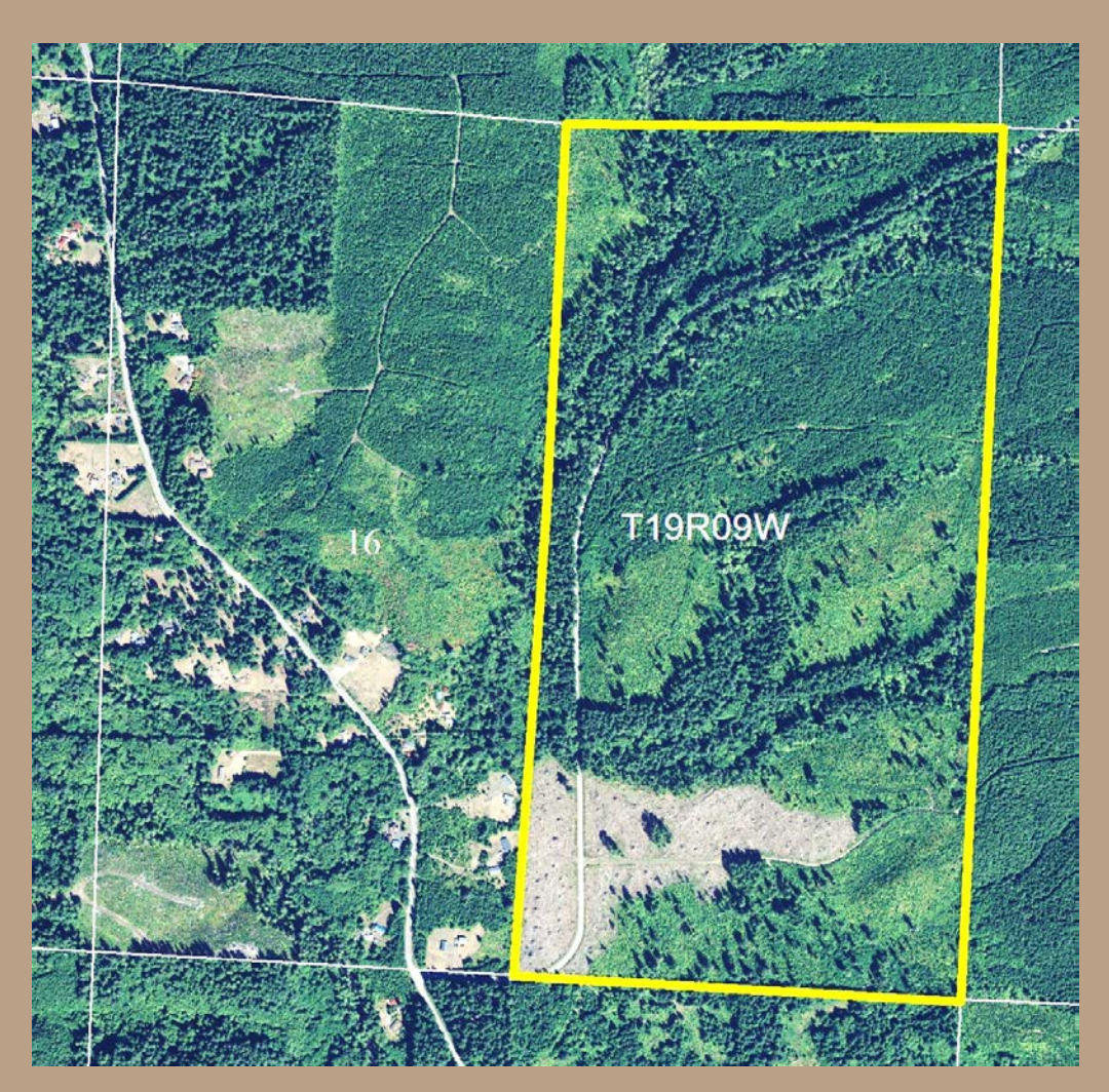
Section 16, Township 19 N, Range 9 W, Grays Harbor