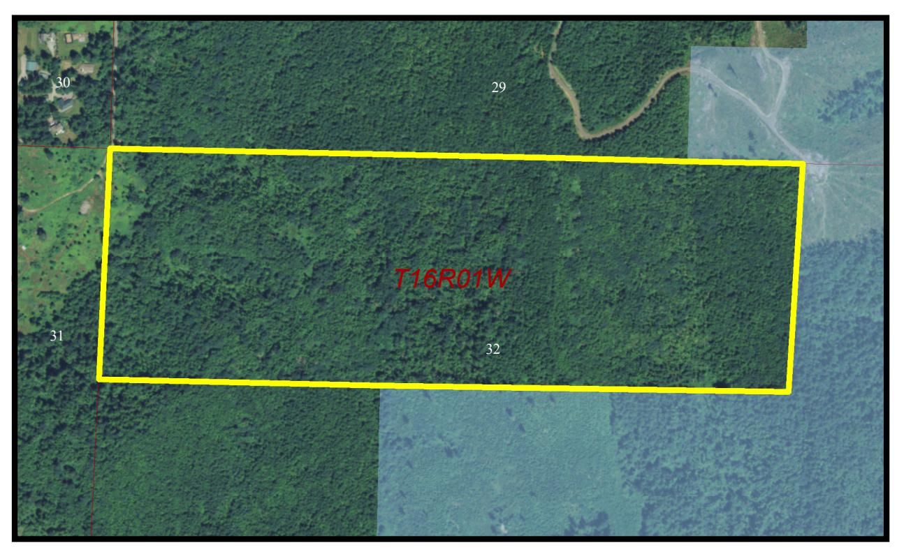
Within Section 32, Township 16 North, Range 1 West, W.M., Thurston County