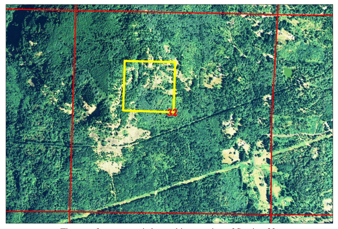
The transfer property is located in a portion of Section 32, Township 2 North, Range 6 East, W.M., Skamania County, Washington.