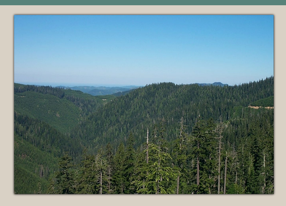
A Presentation to the Board of Natural Resources