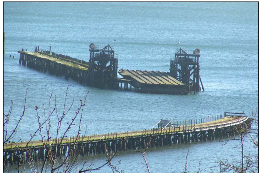
Remaining trestle after removal of damaged sections