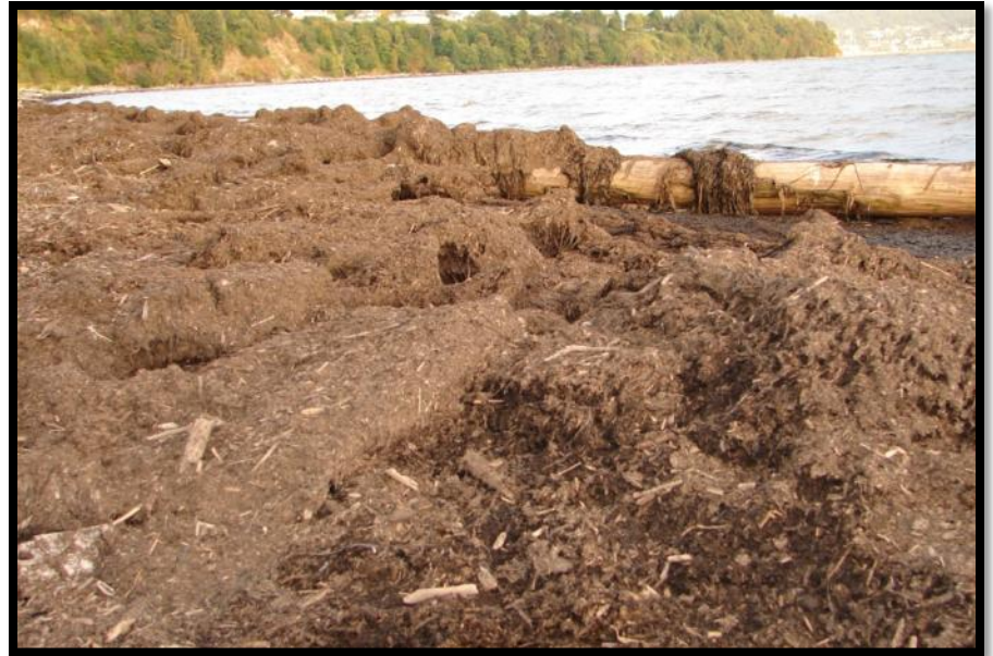
Fine woody debris accumulations on the beach