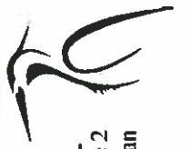
Figure 2 Concept Plan