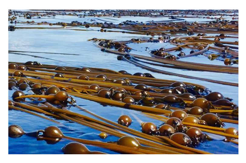
The floating canopy of bull kelp (Nereocsytis luetkeana).

Kelp beds are highly productive nearshore habitats that support salmon, Orca killer whales, forage fish, invertebrates, and marine birds. Many factors, both natural and anthropogenic, affect the extent and composition of kelp beds. DNR has monitored floating surface canopies along the outer coast and the Strait of Juan de Fuca since 1989 using aerial photography. Two species make up these beds, bull kelp (Nereocystis luetkeana) and giant kelp (Macrocystis integrifolia). Some kelp beds persist over decades, while others fluctuate greatly year-to-year. Overall, floating kelp canopies in this area have been stable over the last 3 decades of monitoring. They also appear stable when compared to historical surveys from 1911, with some possible exceptions within Puget Sound. DNR will continue to monitor this important kelp resource. Climate warming is a major concern, as are human impacts. Kelp along the coast and strait is likely to be less vulnerable than the beds in Puget Sound, which are subject to greater human impacts and naturally higher water temperatures.