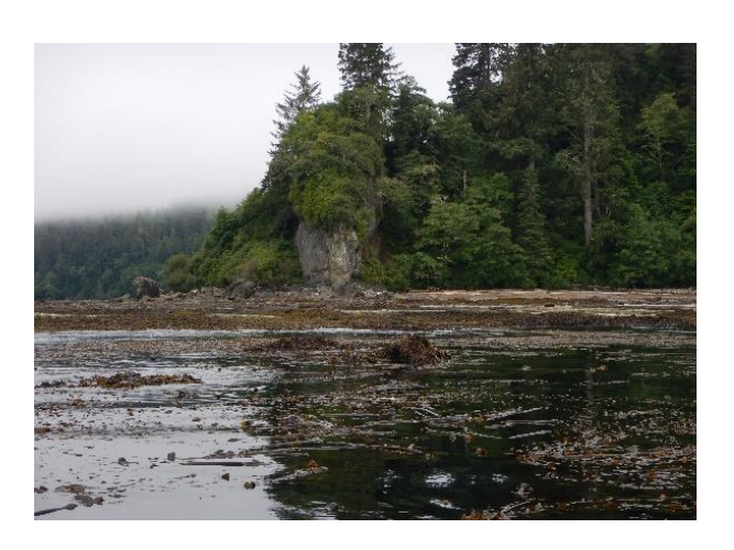
Washington's stunning coastal landscape includes diverse and critical kelp forest ecosystems.