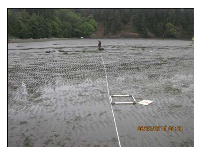
Eelgrass counts were conducted by field staff. The data is compared and evaluated with echosounder data collected at the same sample sites.

Rising sea levels have been recorded and are expected to occur with climate change. This means inundation levels of coastal areas in Washington will change. Zostera marina , and non-native eelgrass, Zostera japonica are distributed at differing elevations. Z. japonica tends to be found at higher intertidal areas than Z. marina . With rising sea levels, it is expected that areas of inundation and exposure will change and, with a change in these environmental conditions, seagrass distribution will be impacted.