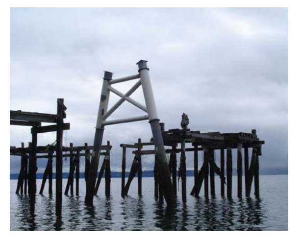
This pile structure was located on the Maury Island shoreline and was removed. Structures such as these altered water flow and sedimentation.