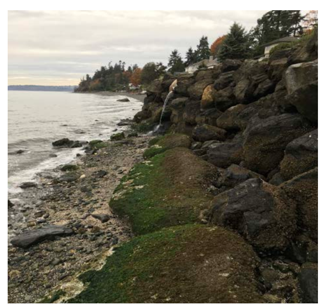
Outfall effluent into the Poverty Bay shoreline can impact aquaculture tract status.