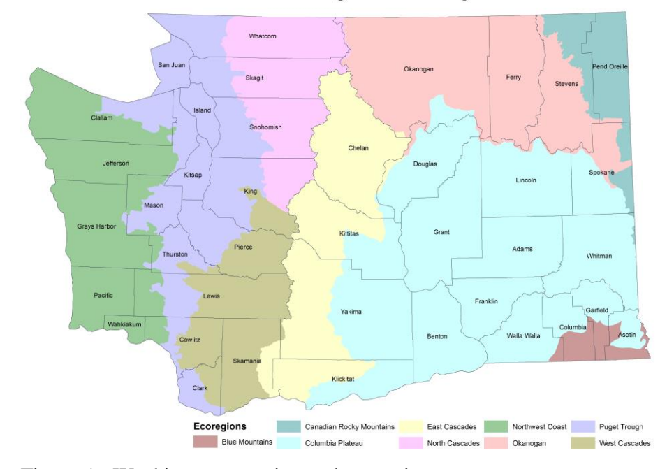
Figure 1. Washington counties and ecoregions.

Ecoregion : Ecoregions are biologically-defined geographic areas with similar environmental, physiographic, or vegetation patterns. WNHP follows the classification of Camp and Gamon (2011). Two-letter codes are used for ecoregion names (Figure 1). Vague or unconfirmed reports are indicated by ?.