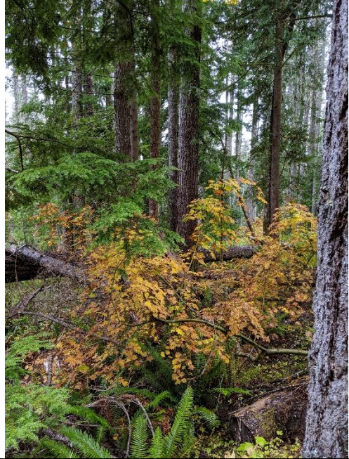
Figure 1: example of downed woody debris after harvest

Harvest sites visited during the audit were found to be efficiently harvested with little marketable timber going to waste. High levels of timber utilization were found throughout the South Puget HCP Planning unit. Down-woody-debris was plentiful on all harvest sites as were standing trees (Figure 1). No non-conformances were identified against this principle.