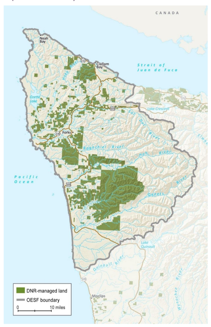
Map 1-1. OESF and Vicinity

The OESF is bordered approximately by the Pacific Ocean to the west, the Strait of Juan de Fuca to the north, and the Olympic Mountains to the east and south (refer to Map 1-1).