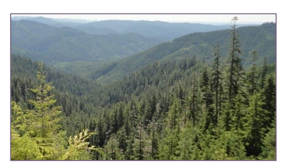
Forested Valley in the OESF

Seasonal rainfall of 80 to 180 inches per year is a notable climatic feature of the OESF. The climate