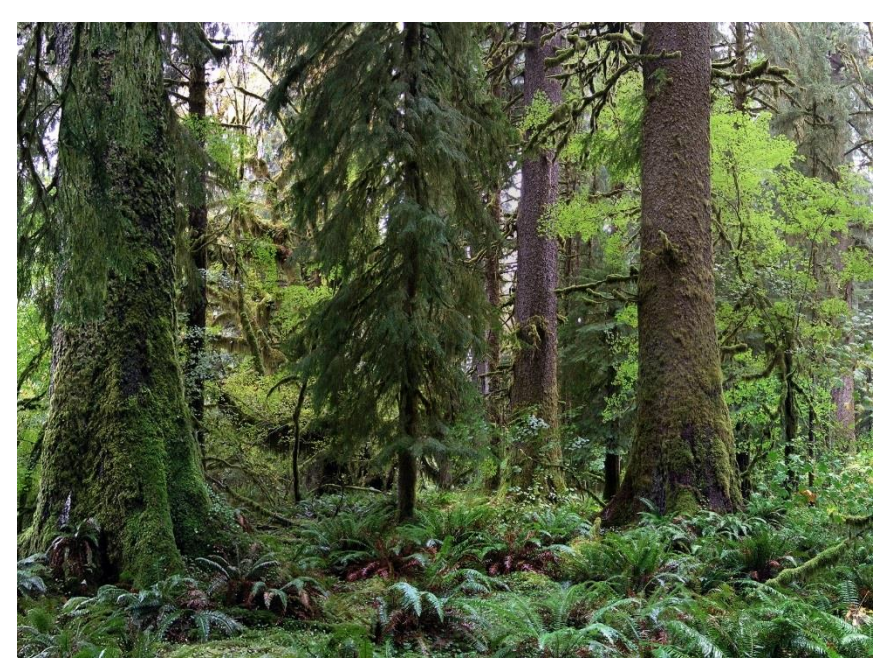
Old Growth Forest in the OESF

In addition to this plan, DNR also maintains a "living library" of up-todate information that foresters and managers need on a daily basis. Located on DNR's intranet, the OESF Living Library includes documents, such as this forest land plan; links to DNR's research database; a discussion board; mapping; and business intelligence such as current harvest volumes, progress toward management objectives, and other data that is continually updated to inform timber sale planning.