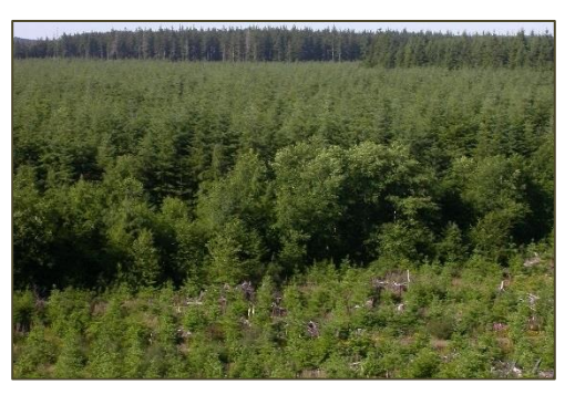
Example of a Forest Plantation

Until the late 1980s, DNR had a policy to harvest the oldest timber first (DNR 1979) to provide greater long-term financial benefits to the trusts. Between 1970 and 1990, over half of the state trust lands that would later be included in the OESF were clearcut and replanted. Per Washington's