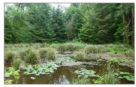
Wetland in the OESF

Wetlands are found in the coastal lowlands and valley bottoms of the major river systems in the OESF, including the lower Queets, Clearwater, Kalaloch, Hoh, Mosquito, Goodman, Bogachiel, Quillayute, Dickey, and Ozette rivers and their