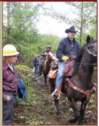
Backcountry Horsemen help check and repair trails.

DNR staff, crews and volunteers are working to clear trails and facilities of storm debris as quickly and efficiently as possible, as we prepare trails and facilities for our season opening on April 1. As you head into the forest, please be especially aware that, due to extreme weather events this winter, many sites and conditions have changed. Please exercise caution and report concerns to your local region.