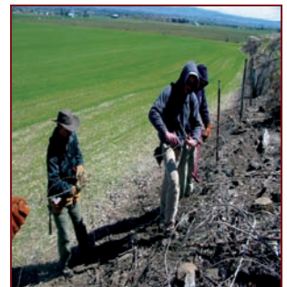
WCC Corpsmembers working with landowner to repair fence for big game management.