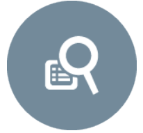
QUERY THE DATA