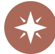
ZOOM TO A LOCATION