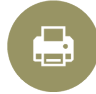
PRINT CUSTOM MAPS