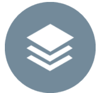
CONTROL MAP CONTENT