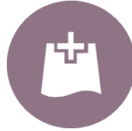
ADD YOUR OWN DATA