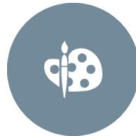
DRAW AND ANNOTATE