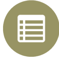
VIEW LAYER ATTRIBUTES

We've added lots of new functionality and improved many of the tools on the Portal