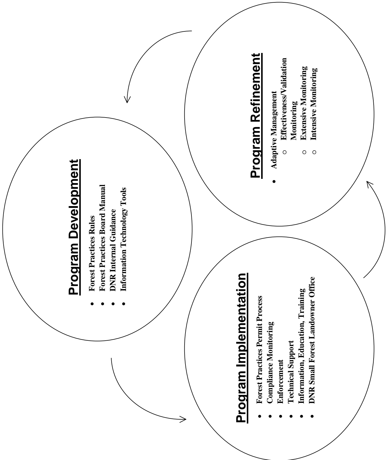
Figure 4.2 The approach to habitat conservation under the Forest Practices Habitat Conservation Plan involves the development, implementation and refinement of Washington’s Forest Practices program.