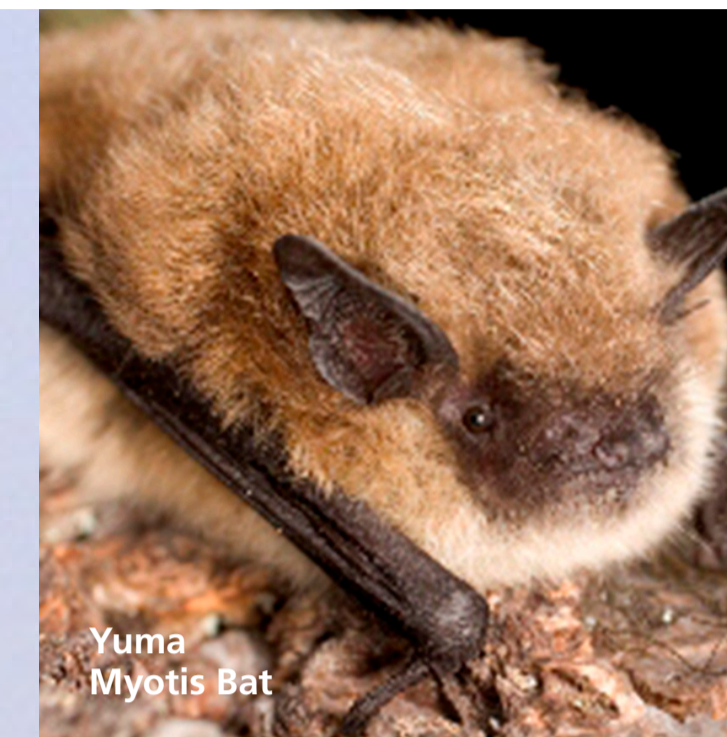
Yuma Myotis Bat