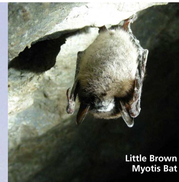
Little Brown Myotis Bat

In 2003 a researcher radio-tagged some bats here at the Woodard Bay roost. He picked up their signal about 8 miles away at Capitol Lake in downtown Olympia, where he found thousands of bats feeding. This is the longest known bat feeding commute in North America.