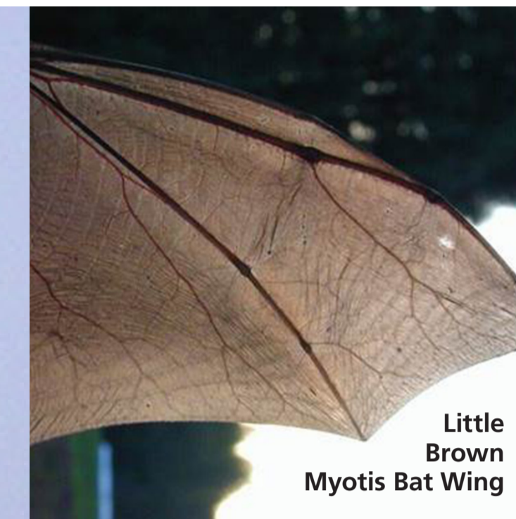
Little Brown Myotis Bat Wing