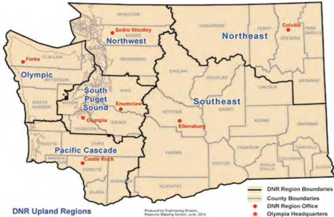
Map of DNR Regions and Offices