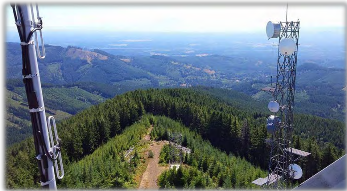
Capitol Peak, South Puget Sound Region