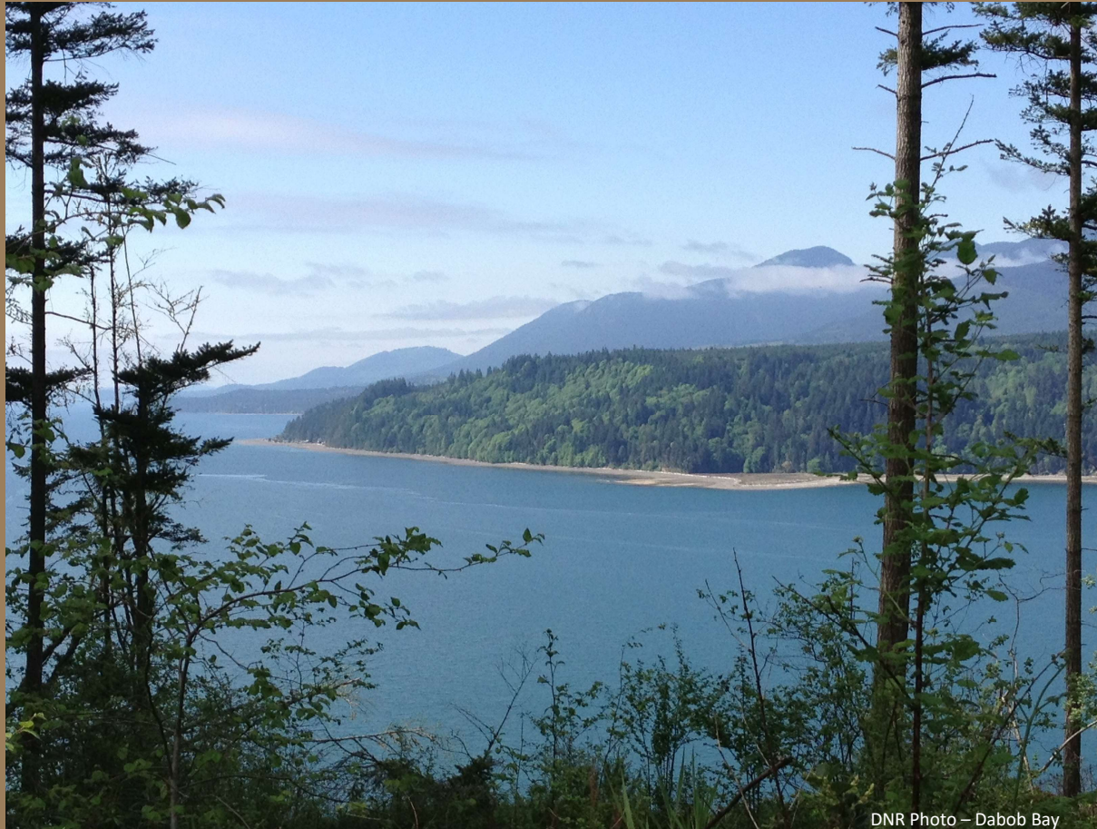
Dabob Bay