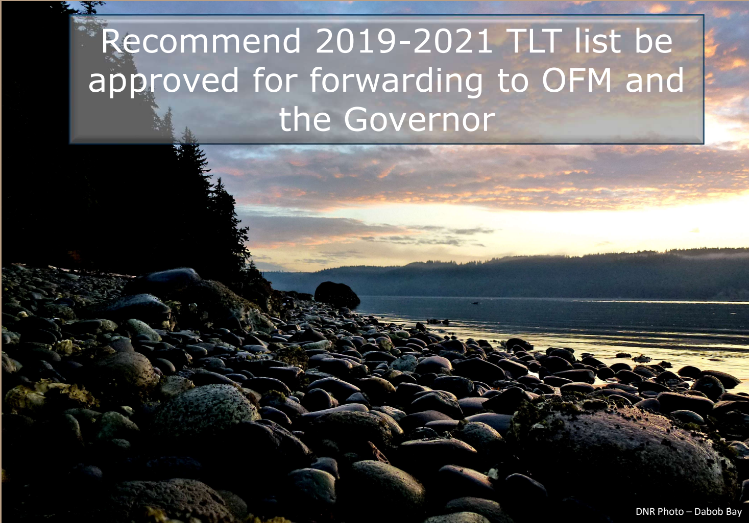
Dabob Bay

Recommend 2019-2021 TLT list be approved for forwarding to OFM and the Governor