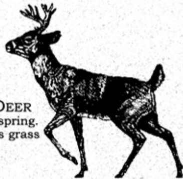
BLACK-TAILED DEER Has fawns in late spring. Shy of people. Eats grass and berries.