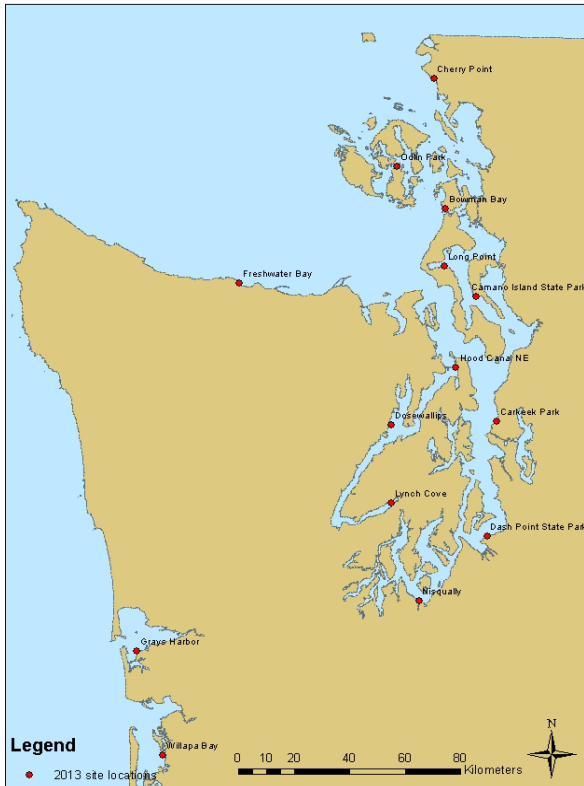
Eelgrass edge sites represent a range of the geographic differences in nearshore systems in Washington state.