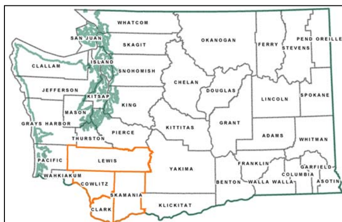
Figure 1. Study area (in orange)

Lewis, Cowlitz, and Clark counties, and very small portions of Thurston County and Skamania County were the boundaries of the study area (Figure 1). The study area was further refined by selecting 1) appropriate soil types from DNR soils data, 2) elevations less than 1500 feet and under from USGS 10-Meter DEM data, and 3) GNIS prairie names. This resulted in 25 target townships.