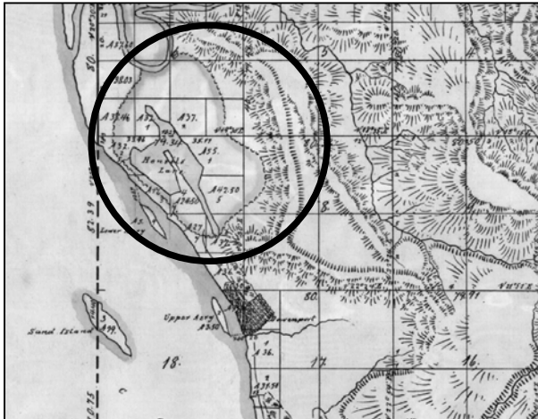
Figure 2. A prairie area on a GLO Cadastral Survey Map