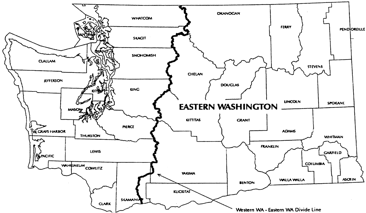
Eastern Washington Definition Map

"Eastern Washington timber habitat types" means elevation ranges associated with tree species assigned for the purpose of riparian management according to the following: